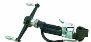
C003 BAND-IT Heavy Duty Tool