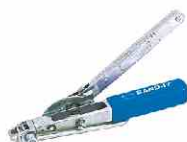
J020 Pok-it Tool