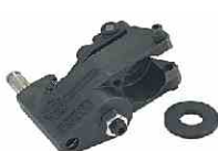
C065 Tension Limiter