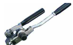
C400 Ratchet Tool