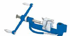
C001 BAND-IT Tool